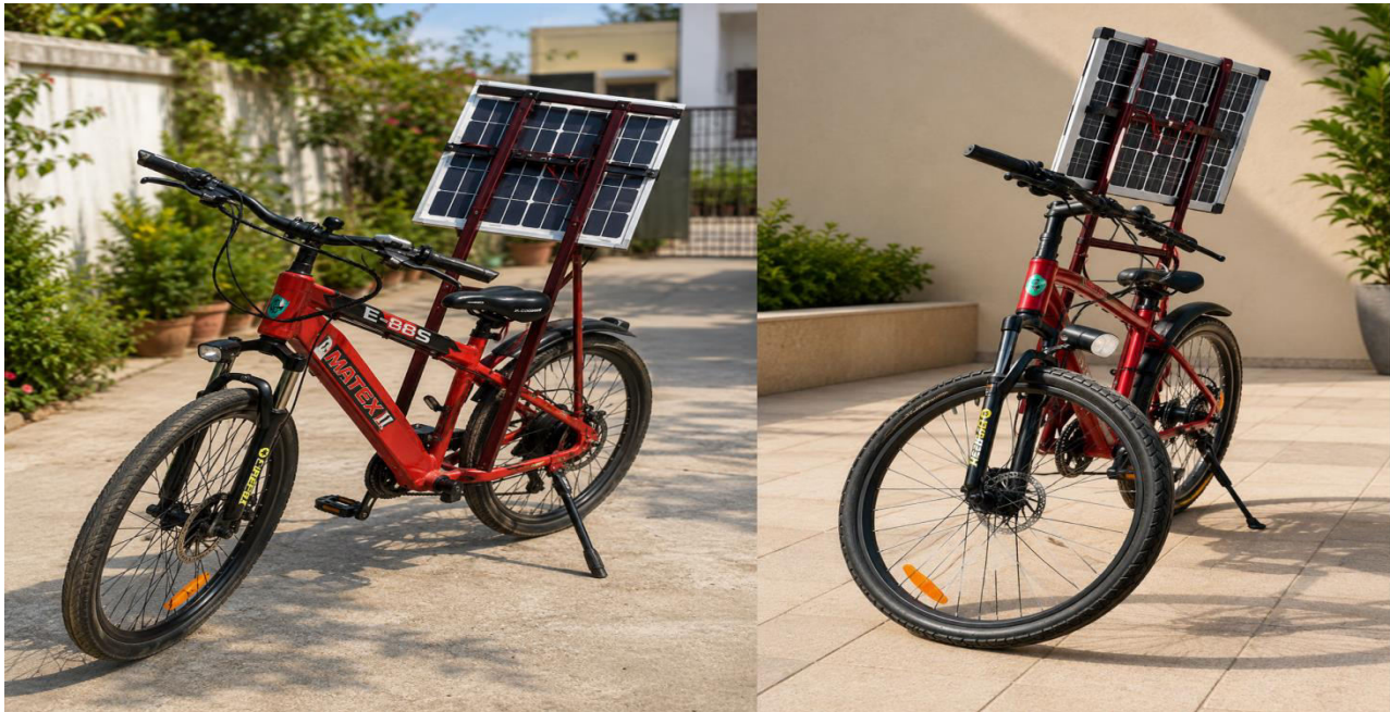
Figure.4.1. Real Time implementation of Front View Final Model of Development of Hybrid E-Bicycle with Multi-features